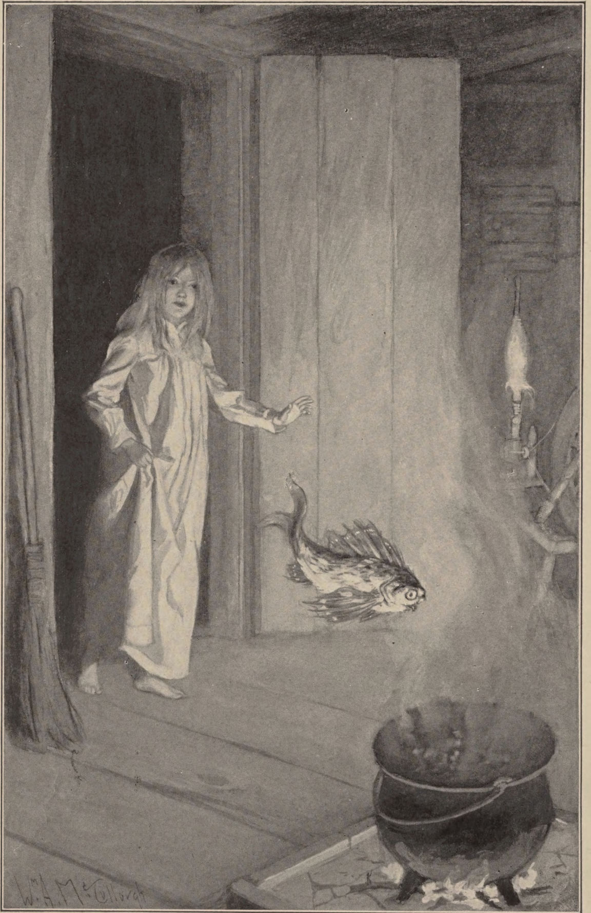
THE AIR-FISH SWAM STRAIGHT TO THE POT